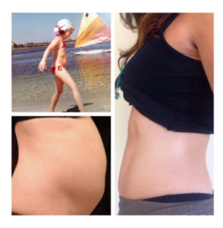
"Leaky gut" stomach before and after...

more I robbed my body of vital nutrients, the less able it was to function normally, the worse my histamine/mast cell induced inflammation became, and the more fearful my body and brain became of all foods, not just inflammation causing ones.