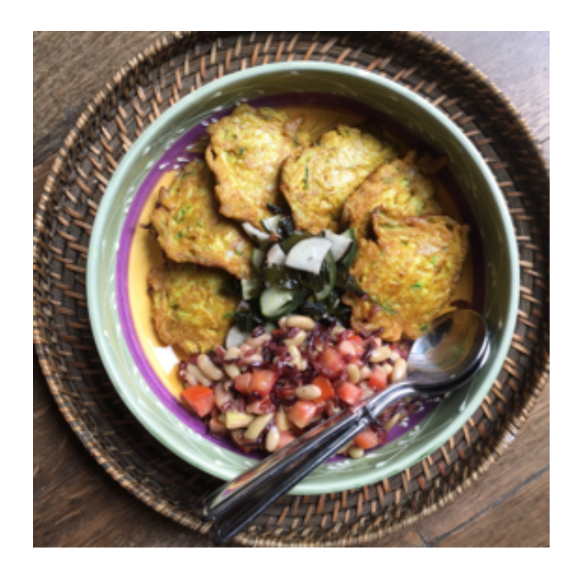
Gluten free vegan pakoras (sides optional)