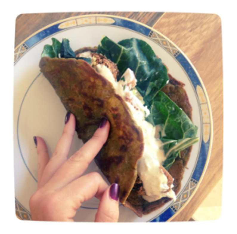
(grain free) click here to view recipe